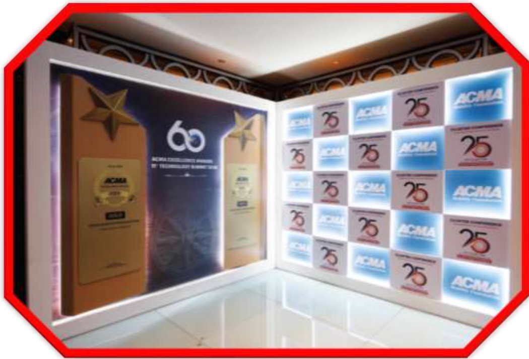
Digital Interaction Wall Where Engagement Meets Innovation

Your Access Point to a Seamless Event Experience