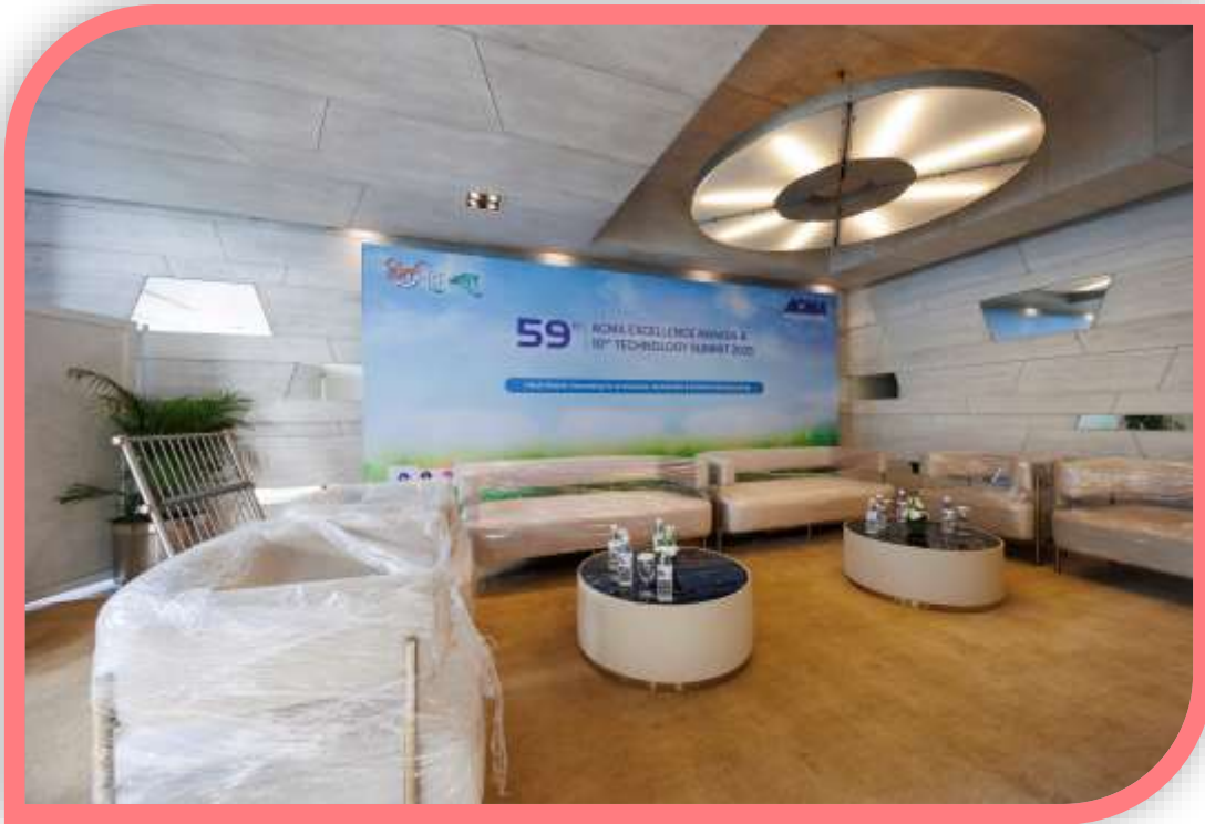
Luxury, Privacy & Priority – All in One Place

Your Access Point to a Seamless Event Experience