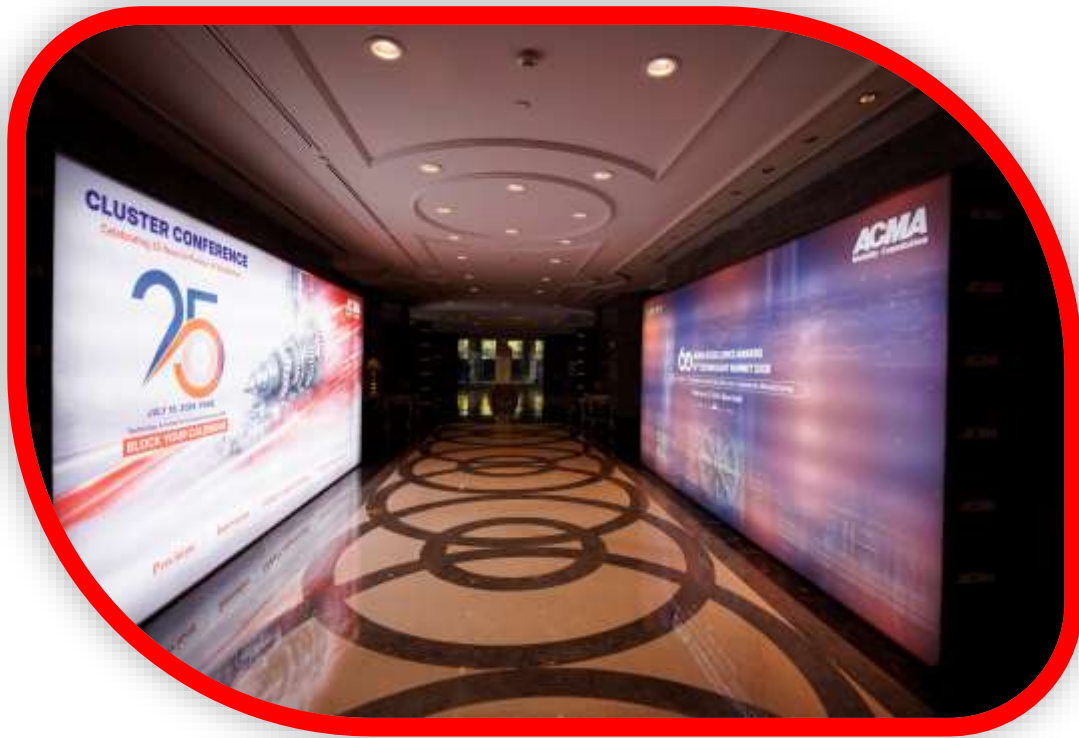
The Grandest Opening to the Best Experience