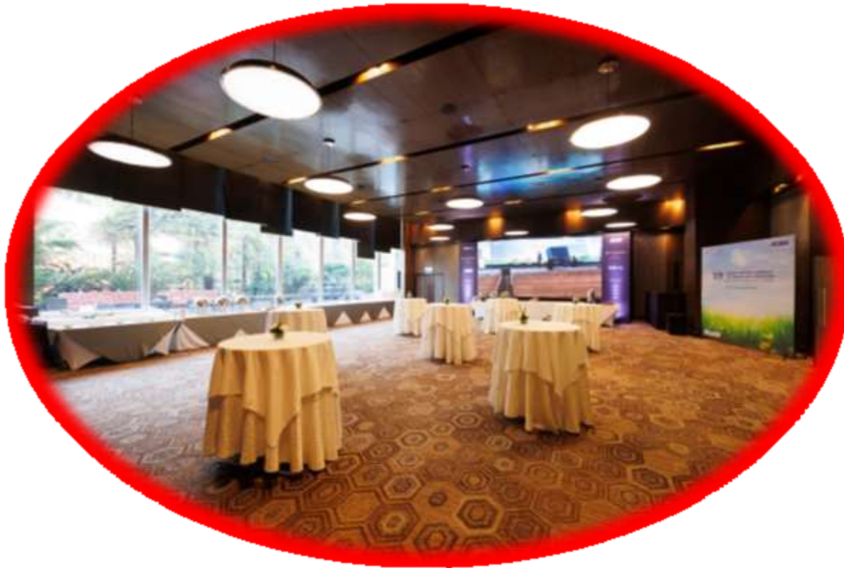
Elevating every lunch moment with your presence