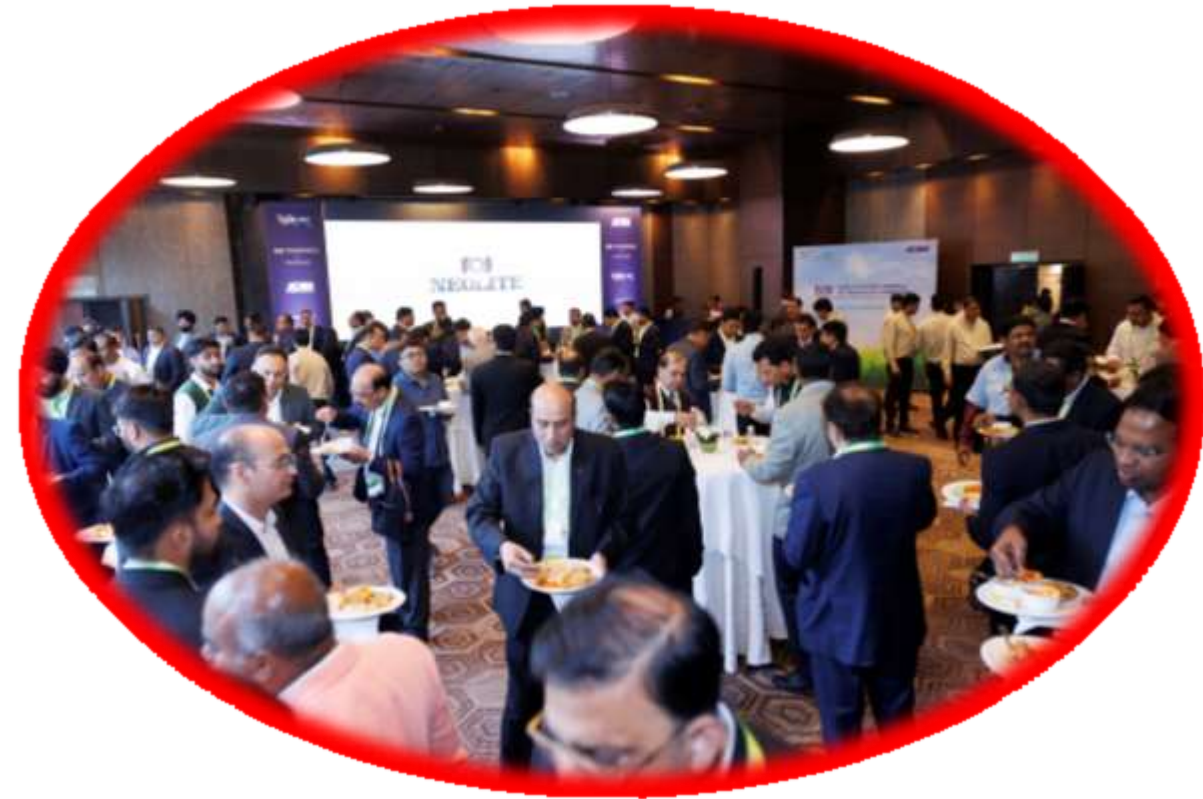
Where Delegates Dine – Your Brand Shines