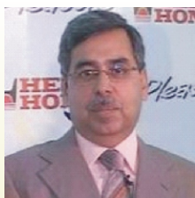
Mr. Pawan Munjal Chairman